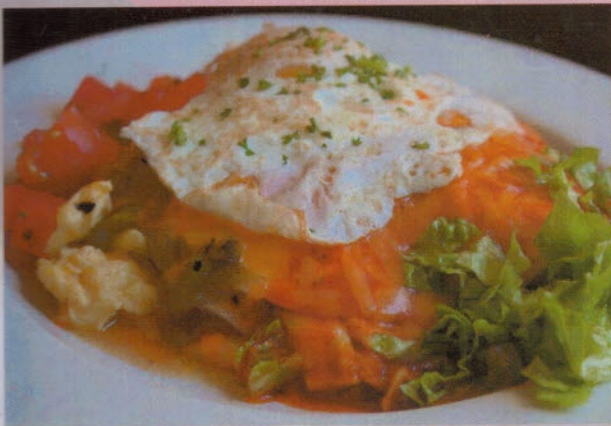
Joe's Breakfast Enchilada

Brunch on Sundays is served from 9:00am through 2:30pm with additional dishes